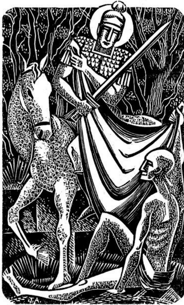
San Martín de Tours, Patrono de la Ciudad