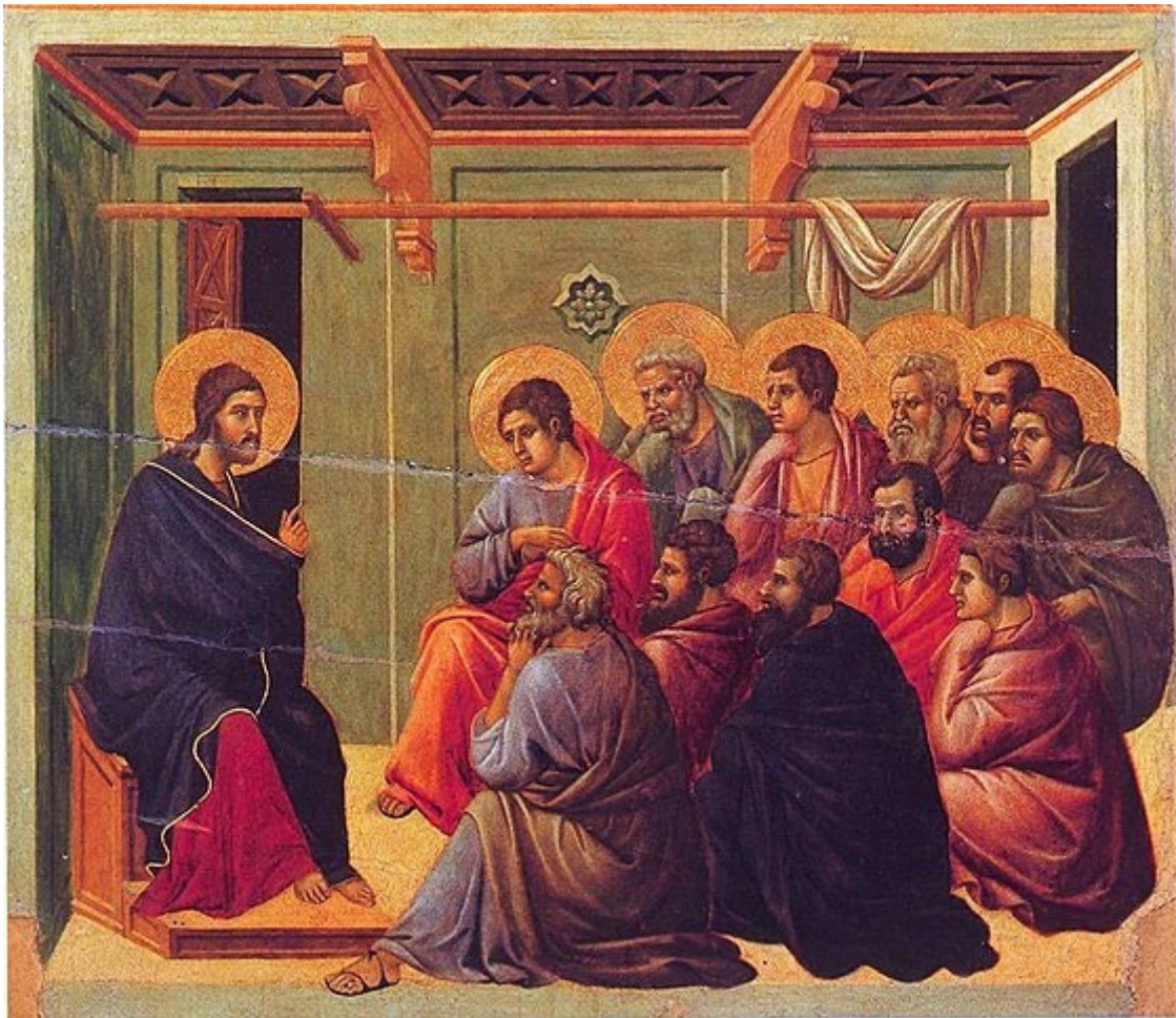
Christ Taking Leave of the Apostles (scene 4) By Duccio di Buoninsegna (1308-1311)